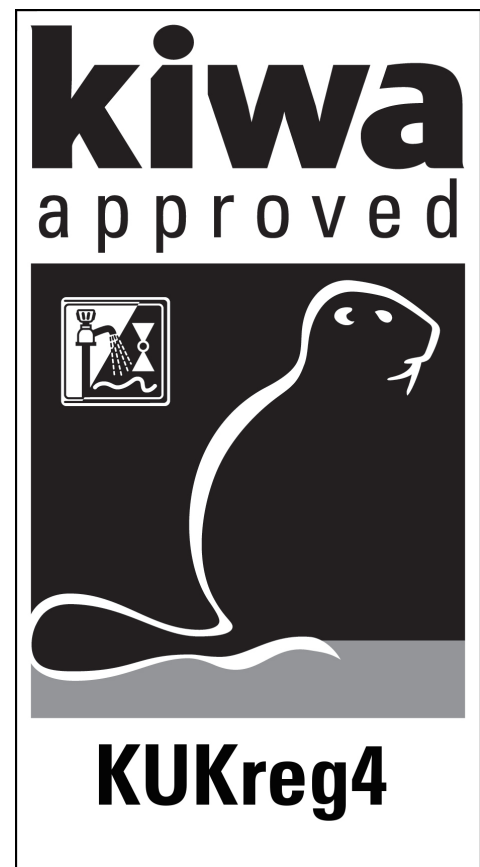
The KUKreg4 Certification Mark

Additionally, using the KUKreg4 Mark demonstrates that you have achieved independent third-party certification, providing your customers with confidence in your products and differentiating those products from market competitors.